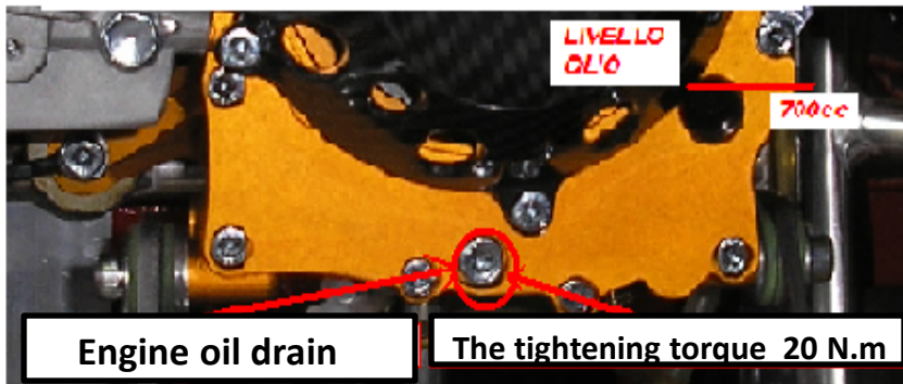
Engine oil drain